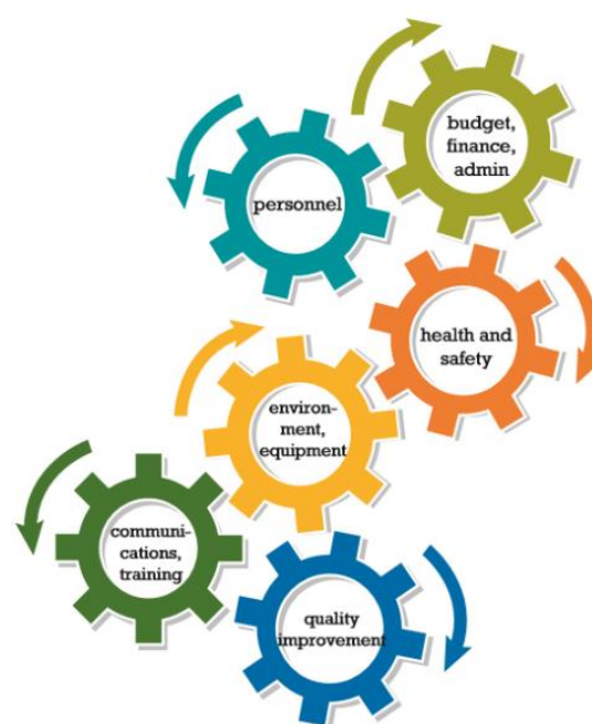
Elements for safe healthcare

management and technology are needed to record data and information, in addition to a strong quality management program that can capture and interpret data and information.